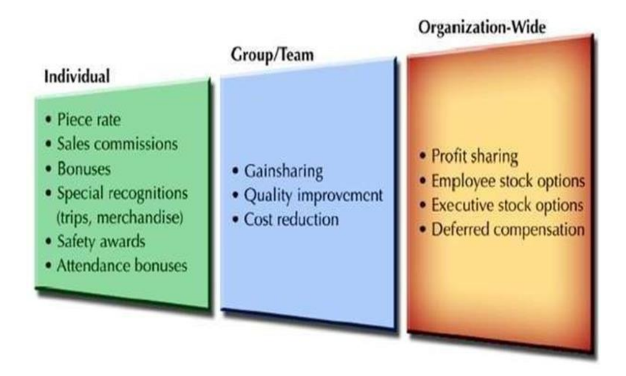
Figure 2.1: Types of Variable Pay Plans By (Robert and John 2003)