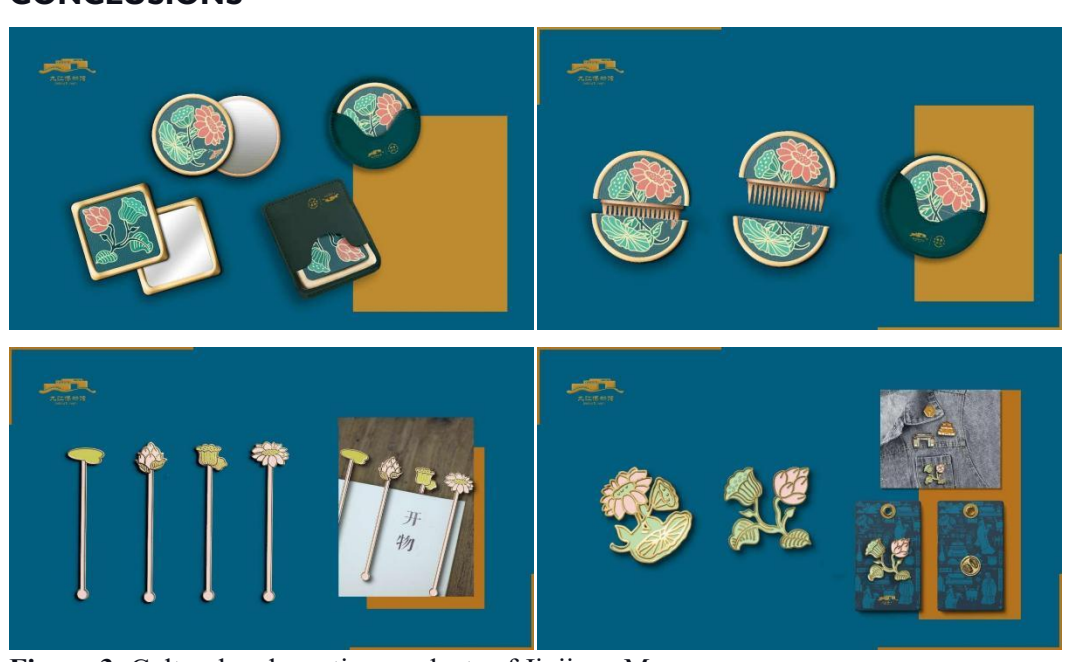
Figure 3: Cultural and creative products of Jiujiang Museum