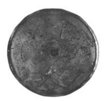
Figure 2: Bronze mirrors with lotus patterns in Song Dynasty