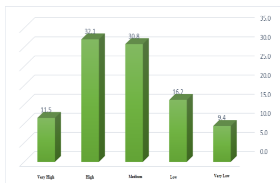
Diagram: Comparison of the frequency of respondent's perspectives on love-based society characteristics

Based on the results stated in Table 4-6 and diagram 4-2, among the 384 individual, 44 individual equals to 11.5% of respondents have estimated very high love-based society characteristics. Also, 123 individual equals to 32.1% have estimated these features as high, 118 people equals to 30.8% estimated these properties as medium, 62 individual equals to 16.2% low, 36 individual equals to 9.4% have estimated the prior characteristics as very low.