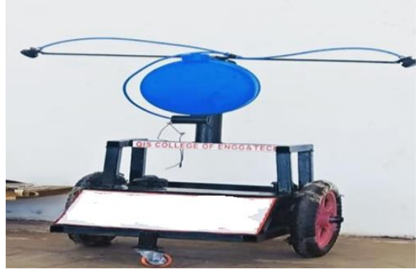
Fig:4. Cleaning Robot Outside view

3. If the toilet is clean, turn off the water, remove the cleaning chemical, and brush the toilet.