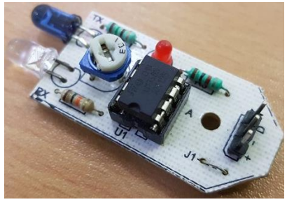
Fig: 2. Circuit Panel

the proposed robot since it is lightweight and sturdy enough for our project.