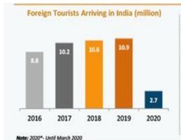
Figure 2 : Foreign Tourists Arriving in India (million)

As per the Federation of Hotel & Restaurant Associations of India (FHRAI), in FY21, the Indian hotel industry has taken a hit of >Rs. 1.30 lakh crore (US$ 17.81 billion) in revenue due to impact of the COVID-19 pandemic.