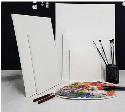
Figure 5: Oil painting box

6.3.3 Step of Creation step 1, the draft drawing. Step 2,3, coloring.