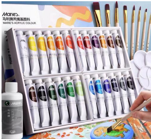
Figure 4: Propylene