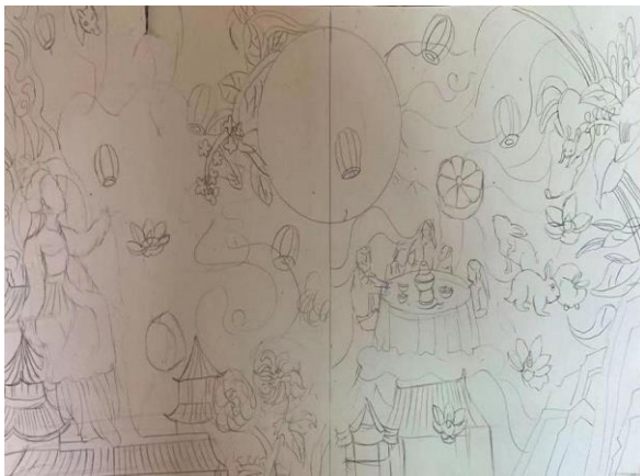
Figure 2: Sketches of the work 2