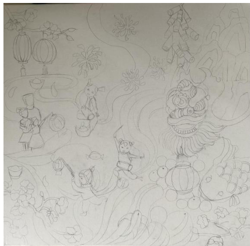
Figure 3: Sketches of the work 3