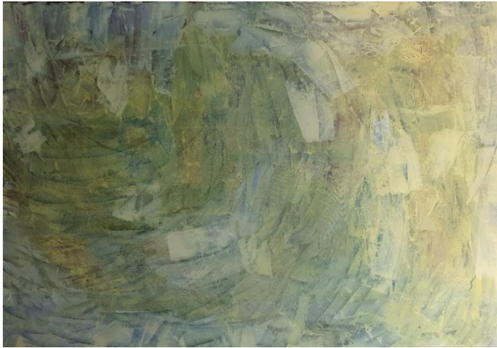
Figure 8: Step 1 Step 2: Paint and color liner.