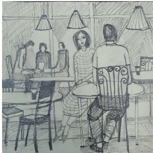
Figure 2: Sketch 2