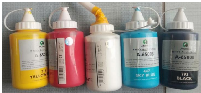
Figure 5: Marie's Acrylic Color - 500ml