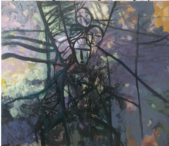
Figure 10: Step 3 Step 4: Paint overlays and scrape layers, adjust the light and dark shades.