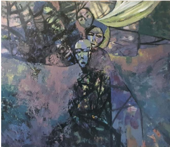
Figure 11: Step 4 Step 5: Editing and finishing works.