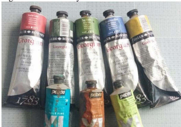
Figure 6 UK made oil colors – Georgian Daler Rowney & France made oil colors Pebeo Huile Fine 250ml/ tube