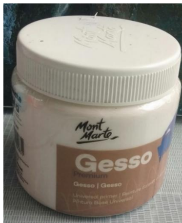
Figure 7 China made Marie's Glue and topcoat - 1000 ml Mont Marte Gesso 500ml/ a box