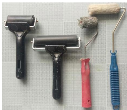
Figure 3: Large and small paintbrushes and rollers of all kinds