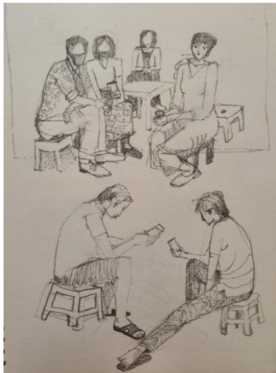
Figure 1: Sketch shape 1

and all that have been formed, are once again sketched on paper through pencils, watercolors, charcoal, etc. or projected onto canvas directly.