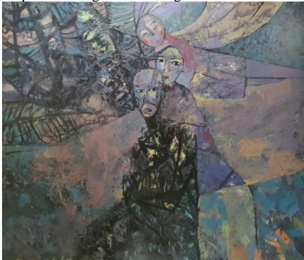
Figure 12: Step 5