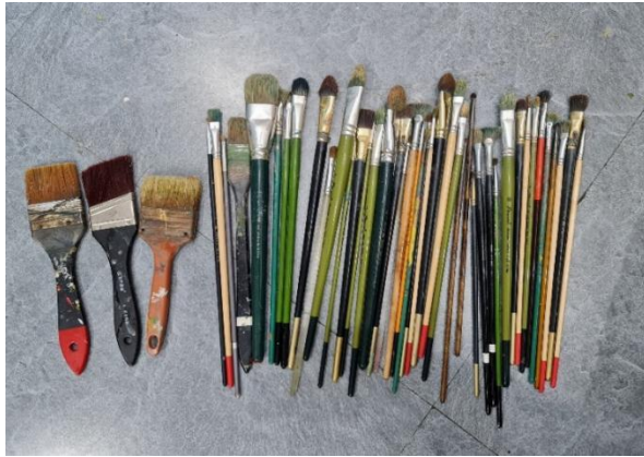
Figure 7: Brushes