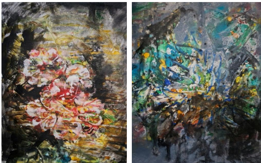
Figure 1: Sketches of the work