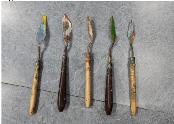
Figure 8: Trowels