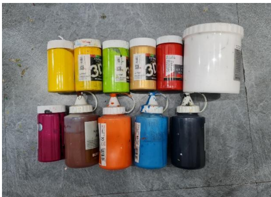
Figure 6: Acrylic color