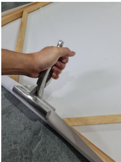
Figure 5: Canvas frame

I present the work with acrylic paint on canvas, and use the following items to create the work: