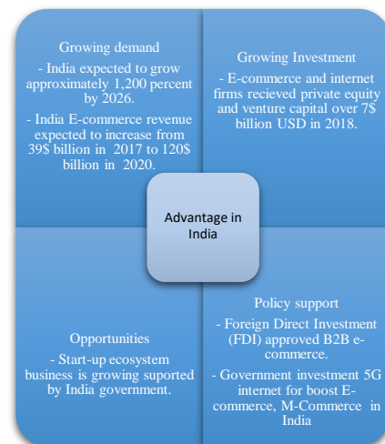
Figure 4 Advantage in India

There is a general agreement that m-commerce has enhanced the potential for exponential growth in the digital payments market; however, various issues and challenges arise, which limits the growth. It is argued that m-commerce has exacerbated the consumer privacy concerns experienced in e-commerce, making consumers reluctant to trust the usage and sharing of personal information with merchants. Besides, the use of wireless networks allows the tracking of users, leaving a grey area in addressing security concerns [27]. Further, there is the risk of bypassing restrictions to gain access to consumer information, especially by marketing firms.