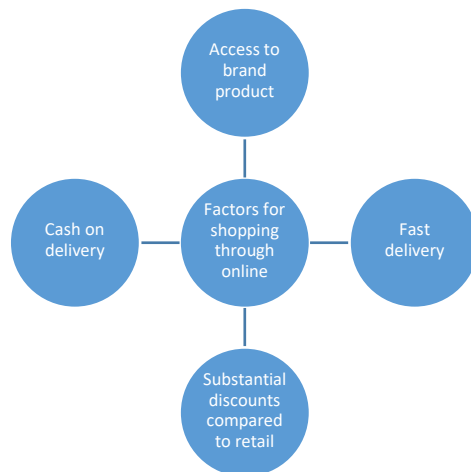
Figure 3 Factors for shopping through online