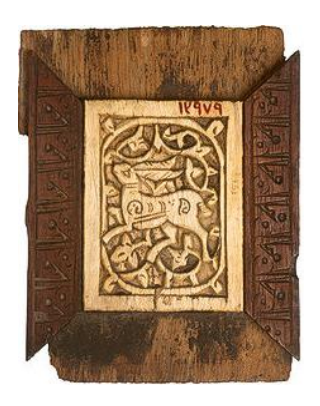
Figure (1) Carving on wood from the Fatimid era

Since the dawn of history, man has used wood in the manufacture of his tools, which represents one of the distinctive features of the world heritage. The craftsmen used various types of wood to reflect his aesthetic vision. He left us with many experiences in which the craftsmen adhered to the customs and traditions of his community as well as individual and collective taste. (Herodotus, 1987). Wood is a basic material for many creative people as it is a medium of expression, and there are many examples from Middle Eastern countries that were elaborately crafted for decorative or religious purposes (Anapur, 2017). Figure (1)