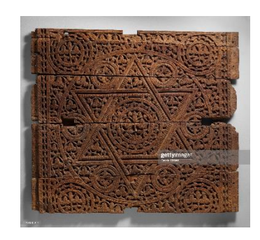
Figure (3) Panel, early 9th century, From Iraq, probably Baghdad. Found Iraq, Takrit, Wood (teak); carved, H. 29 1/2 in. (74.9 cm), Wood, The carved vine leaves, scrolls, border designs, and other details of this panel are typical of early Islamic woodcarving, https://cutt.us/8gvYN

In oblique engraving, Museum of Islamic Art in Cairo, https://cutt.us/mUPJ2