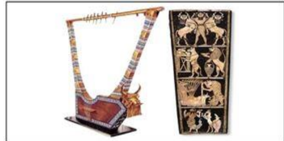
(Fig. 1) The royal harp, discovered in the Royal Cemetery of Ur, Iraq Museum.

advantage of animals in the field of entertainment and entertainment, and this can be seen through the illustrated scenes that adorn the facade of the Sumerian harp discovered in the royal cemetery of Ur, dating back to about 2450 BC. See (Fig. 1).