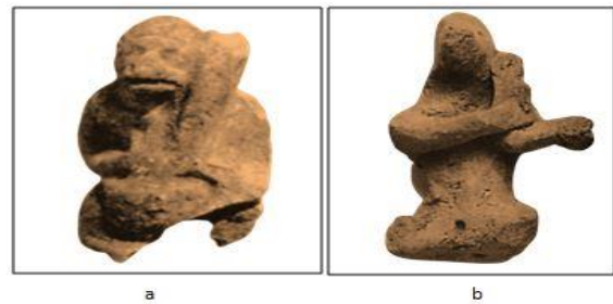
(Fig. 10) Two monkeys dating back to the Neo-Babylonian era, British Museum.

Also in the same era, two statues of a monkey made of clay appear to us. In the first of them, the monkey is sitting and carrying a circular thing on his knees. This may indicate the use of the drum by the monkey, as in (Fig. 10a), As for the second monkey, it appears carrying something on its shoulder. This may indicate a type of musical instrument, as in (Fig. 10b).