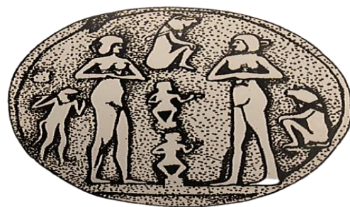
(Fig. 5) A scene on a pottery slab, the Old Babylonian period, the Iraqi Museum

To confirm more about this, a pottery tablet dating back to the ancient Babylonian era was found. In this tablet, the musicians are dwarves who play musical instruments, and two naked women clasped hands, and also three monkeys appear doing acrobatic movements and performing comedy shows to make people happy, looking at (Fig. 5).