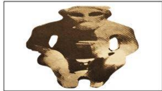
(Fig. 4) A model of a monkey made of alabaster, the Old Babylonian period.

Many models of monkeys appear in the old Babylonian era, and they are depicted in many cases in cylinder seals, pottery plates and artistic scenes in that era, and this also indicates the continuation of trade with India and Africa in order to obtain monkeys. This ancient monkey has a hole from the base that may have been fixed on the columns, and this indicates the spread of monkeys in the Old Babylonian era, look at (Fig. 4).