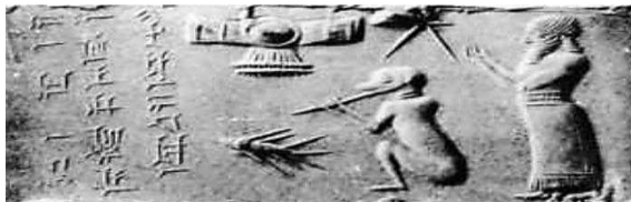
(Fig. 9) Cylinder seal dating back to the neo-Babylonian era, the National Library in Paris.

To emphasize the prevalence of animal comedies and their contribution to spreading the spirit of entertainment and entertainment among the inhabitants of ancient Iraq, it appears in a Babylonian cylinder seal preserved in the National Library in Paris dating back to the modern Babylonian period, a monkey sitting in front of a human and the monkey playing a musical instrument, look at (Fig. 9).