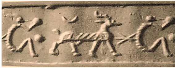
(Fig. 8) Cylinder seal from the Neo-Babylonian period, British Museum.

To emphasize the prevalence of animal comedies and their contribution to spreading the spirit of entertainment and entertainment among the inhabitants of ancient Iraq, it appears in a Babylonian cylinder seal preserved in the National Library in Paris dating back to the modern Babylonian period, a monkey sitting in front of a human and the monkey playing a musical instrument, look at (Fig. 9).