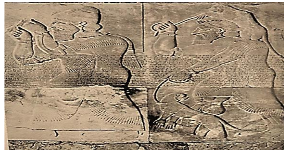
(Fig. 7) an alabaster slab adorning the facade of the throne room of King Ashurnasir Pal II

The Assyrian inscriptions depicted these events for us, as it appears on the front of the entrance to the throne room in the palace of King Ashur Nasir-e-Bal II, a slab of alabaster carved on it by foreign people, most of whom are captives, carrying gifts to King Ashur-Nasir-Bal II, and among these gifts were monkeys, See (Fig. 7).