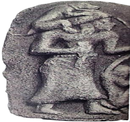
(Fig. 6) A pottery slab representing the image of a monkey dating back to the Old Babylonian

All these evidences point to the prevalence of animal comedies in ancient Mesopotamia, the use of animals in acrobatic and musical performances, and the interest of kings in bringing animals from different countries to achieve prosperity. In the introduction to Sharia: