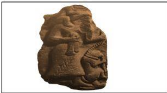
(Fig. 3) Terracotta panel, Ur III, British Museum.

And to confirm this is the discovery of a tablet in Ur dating back to the third dynasty of Ur, showing a bearded man with two monkeys, and he holds in his left hand a chain connected to the neck of the two monkeys, one of them on his shoulder and the other sitting in front of him playing a flute, and the man holds in his right hand something introverted. To be another musical instrument, see (Fig. 3).