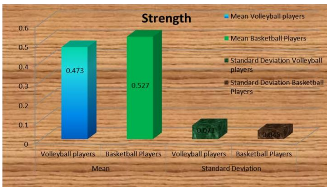
Figure 1: Indicate and Average Deviation of Potency of Volleyball and Basketball Players.

Deviation of potency of Volleyball and Basketball players.