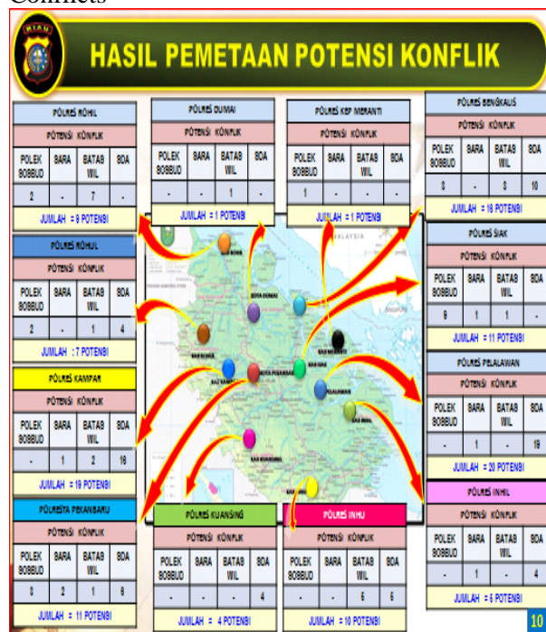
Table 2. RESULTS Mapping Potential Conflicts