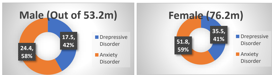
Figure 2. COVID-19 pandemic impact on Global Mental Health on Gender in 2020

In this investigation, an additional instance of major depressive disorder and anxiety disorder, as well as other mild symptoms such as insomnia, denial, rage, and terror, were discovered worldwide due to COVID-19 pandemic. It was