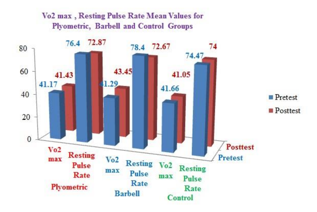
Figure (A) Showing the mean values of Vo2 max, Resting pulse rate for Plyometric, Barbell and Control Groups among Engineering College Kabaddi Players