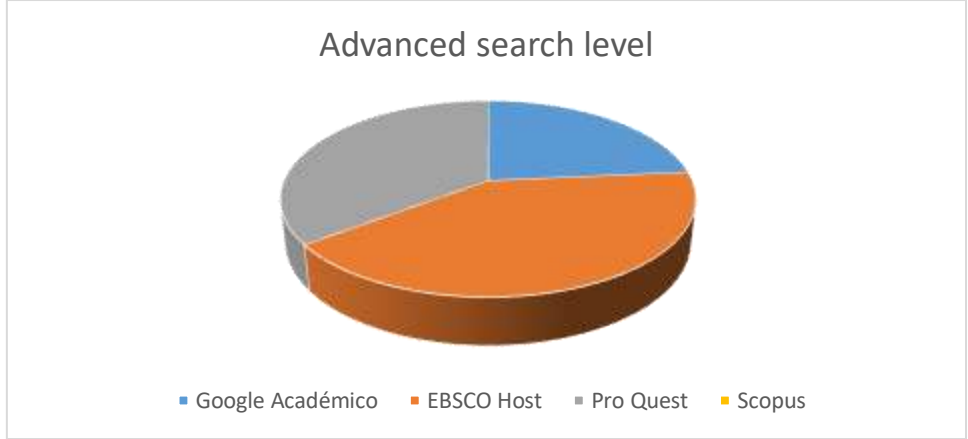
Figure 2. Advanced level of database search.

research, the same ones that are shown in the legend of the following image