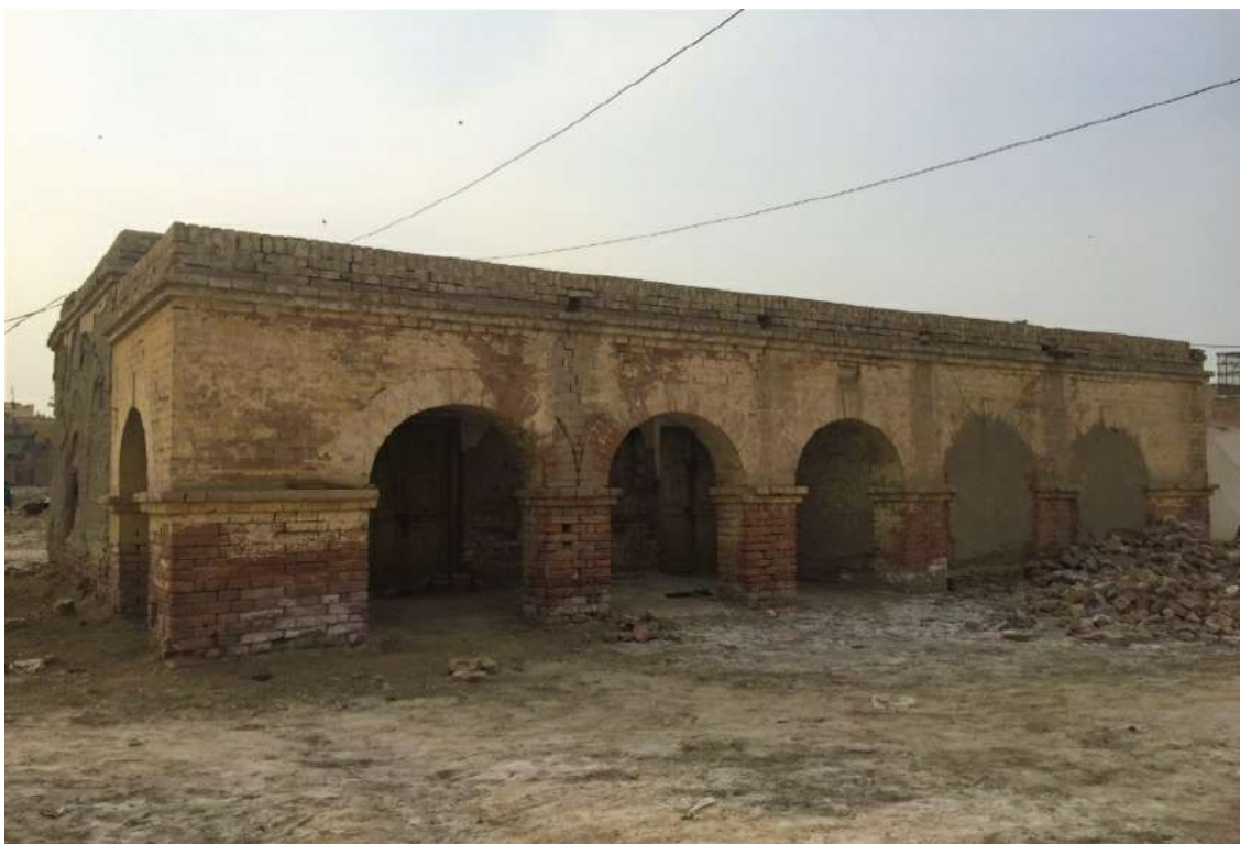
Fig. 10. Quarters, Inspections Bungalow at Shikarpur.