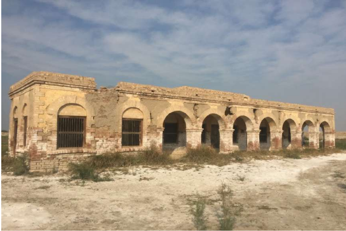
Fig. 5. Quarter, Inspection Bungalow at Ruk.