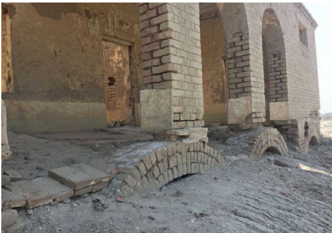
Fig. 8. Brick-lined arches of old structure, Inspection Bungalow at Chiman.