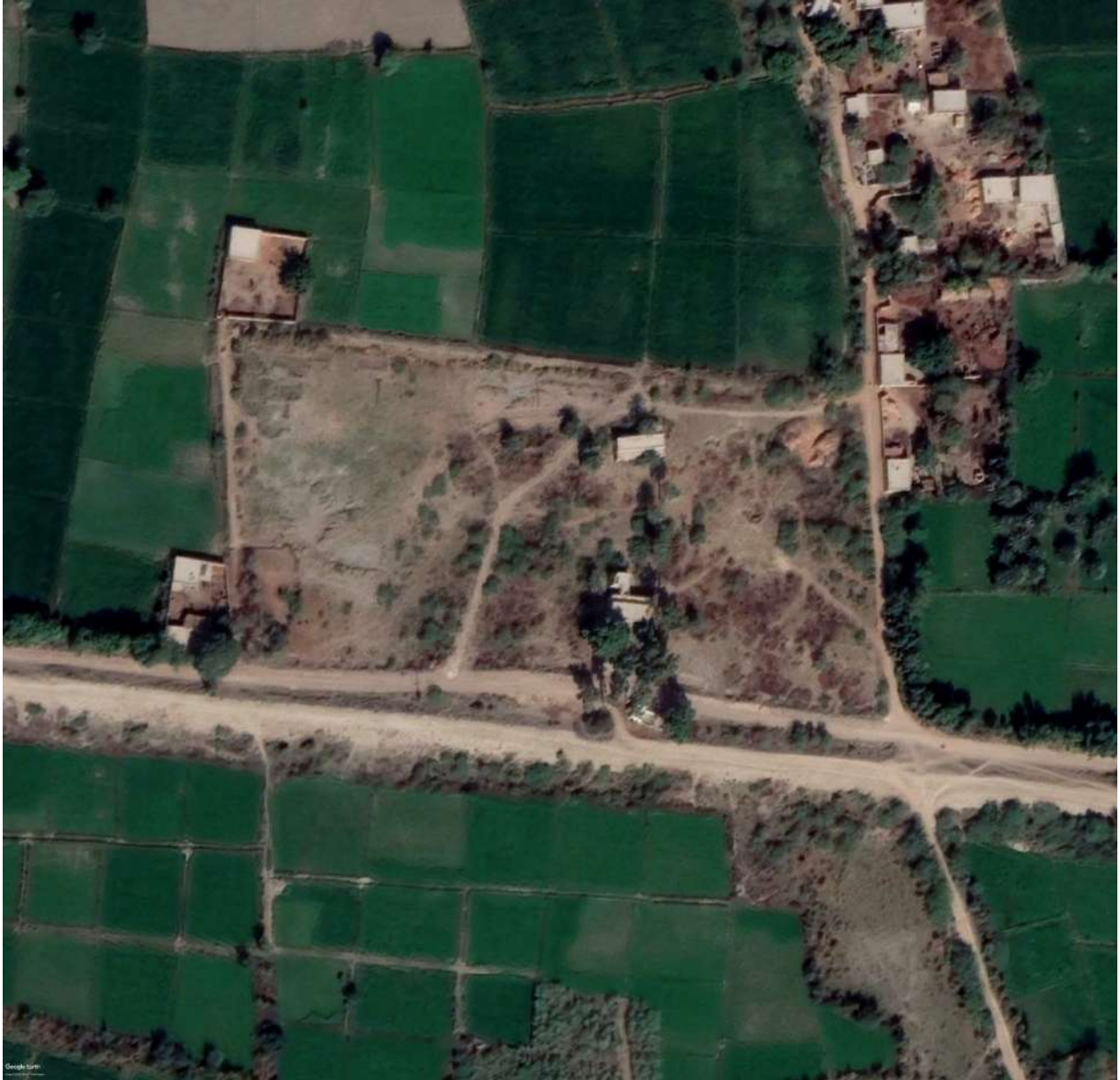
Fig. 11. Aerial view of Ayo-jo-Goth Bungalow compound (in the centre) in Shikarpur.