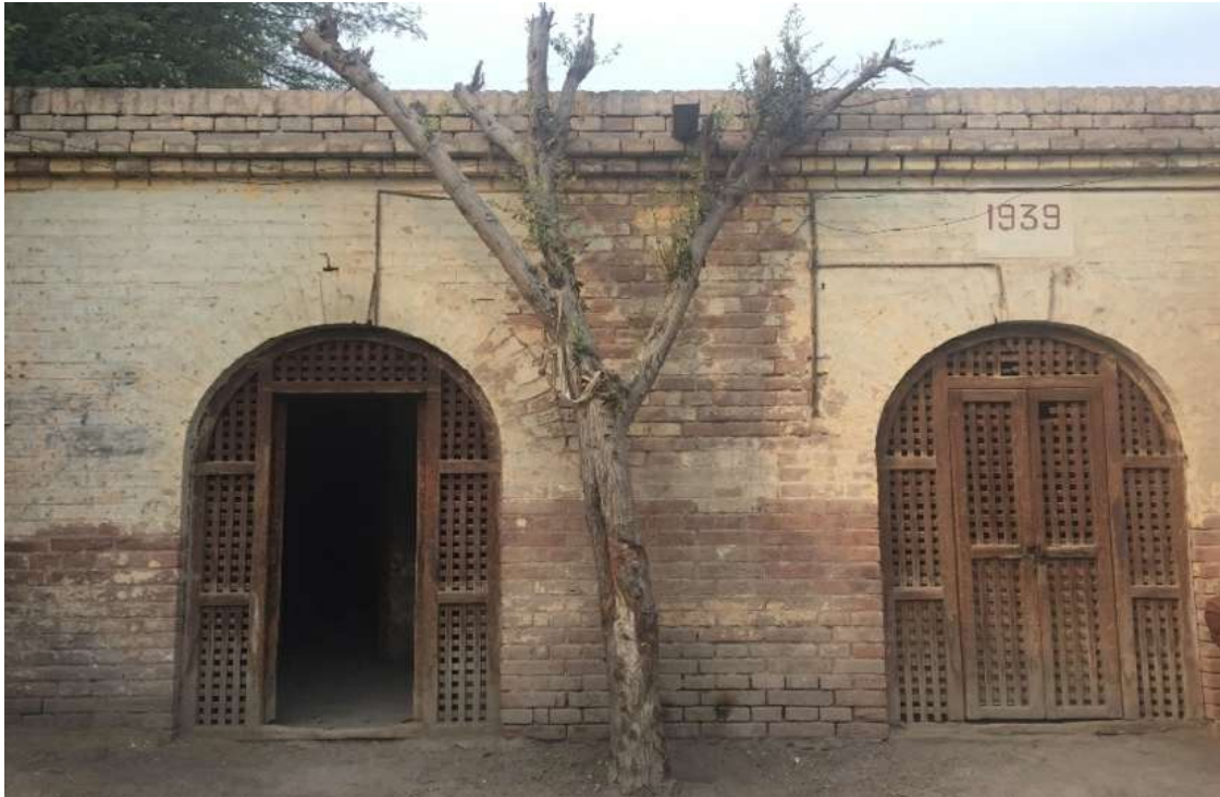
Fig. 9. Quarters, District Bungalow at Shikarpur.