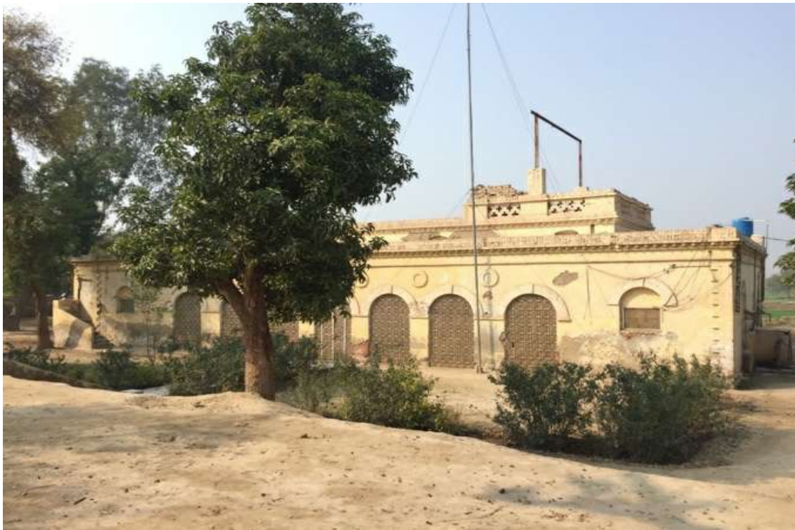
Fig. 6. Suite, Inspection Bungalow at Chak.