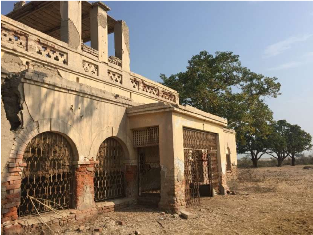
Fig. 7. Suite, Inspection Bungalow at Shahpur.