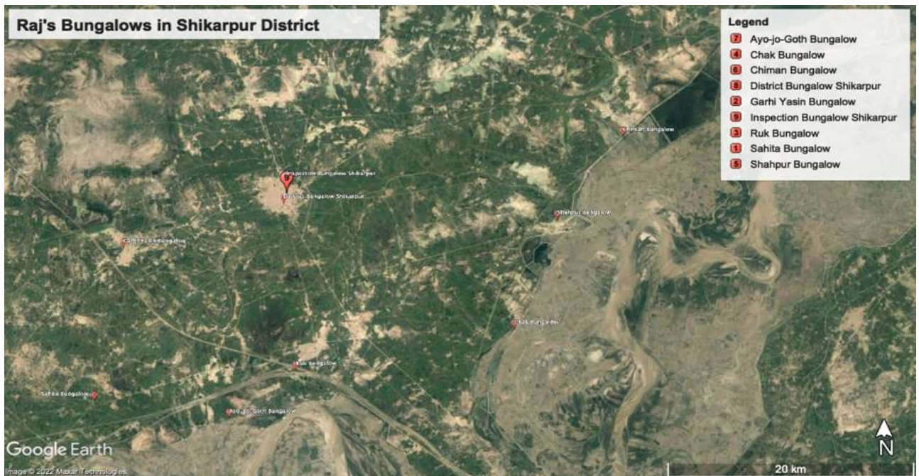
Fig. 2. Raj's bungalows in District Shikarpur (locations marked on Google Earth).