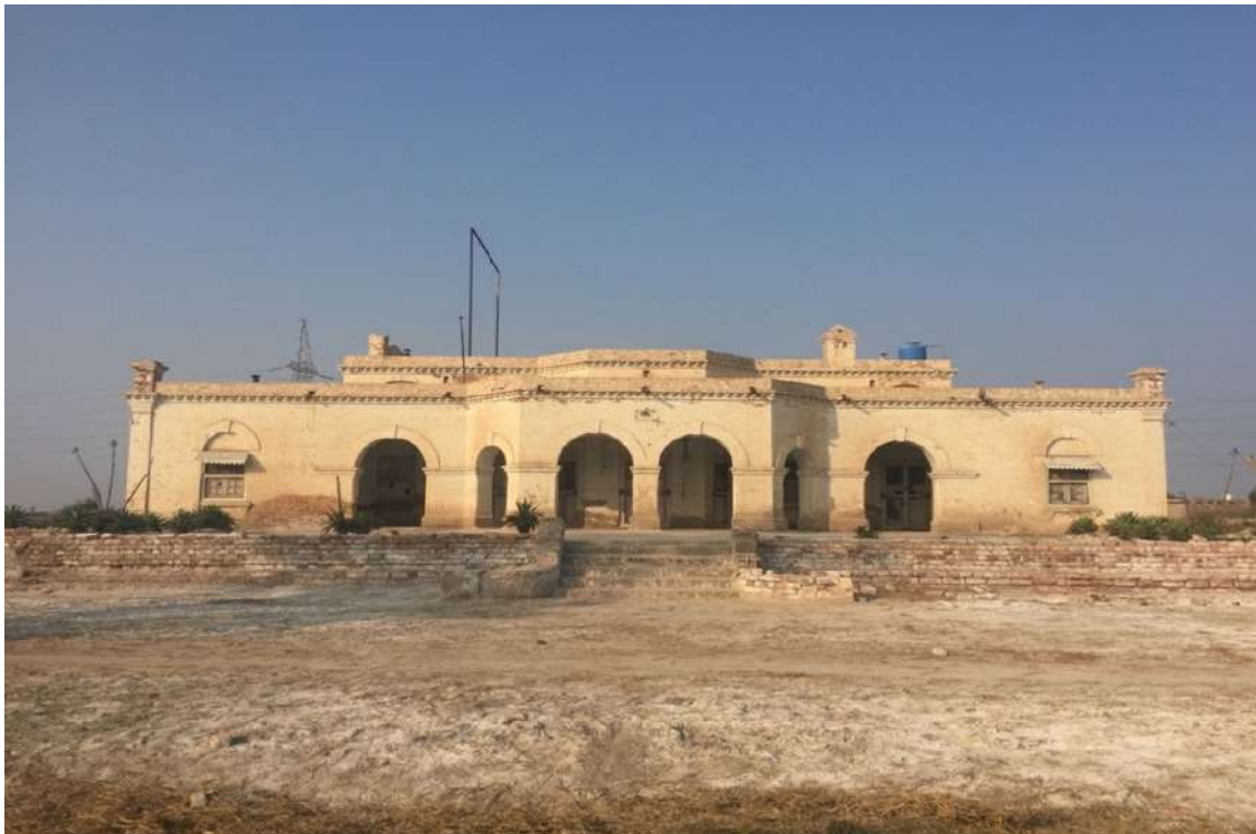
Fig. 4. Suite, Inspection Bungalow at Garhi Yasin.