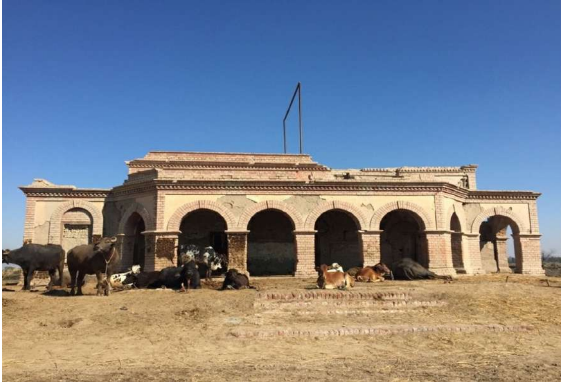
Fig. 3. Suite, Inspection Bungalow at Sahita.