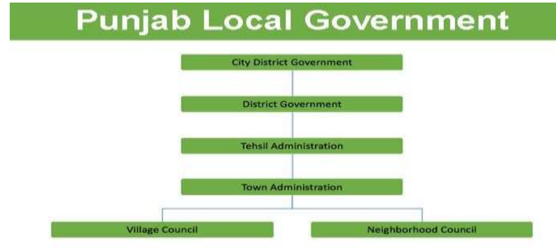
Fig 1: PUNJAB LOCAL GOVERNMENT ACT 1959

Tehsil and town administration .The town administration further consisted of village and neighborhood councils.<sup>16</sup>