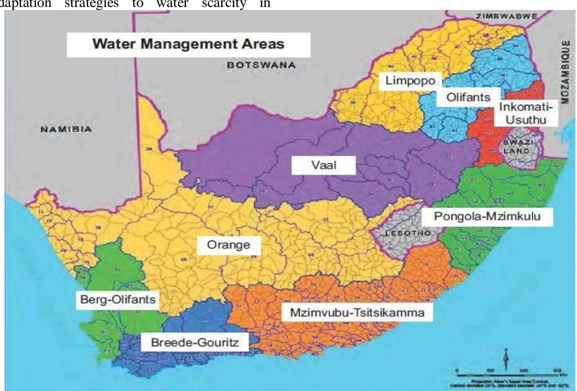
Figure 15: Nine water management areas in South Africa

agriculture as the impacts of climate are gradually transforming the nature of current water security. Variation in climatic conditions and persisting drought occurrences further increases the complexity of water management. Water management strategies in agriculture involve the application and use of a variety of infrastructure and equipment (Iglesias & Garrote 2015). The short-term water management responses can be referred to as managing strategies, while long-term actions which assist in dealing with future inconsistency could collectively be referred to as the adaptation strategies (Garcia de Jalon, Iglesias & Diaz 2014). Water management strategies agriculture needs to be viewed in relation to the increased scarcity of water most especially during farming. Building resilience to the increasing scarcity of water nationally can assist in reducing water constrain amongst farmers as well as natural ecological environment.