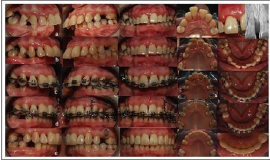
Figure 1: Incisor Proclination, Extrusion, Spacing & other signs of periodontitis 3 .