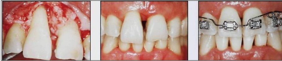
Figure 2 shows Dehiscence and formation of Midline Diastema and its correction 4 .