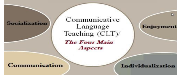
Design 2: CLT approaches are often used in learner-centredclassrooms.

Since 1970s it had been realized that communicative competence was needed in order to use the language communicatively. In planning a language courses within a communicative approach, grammar was no longer use as the starting point. It was argued that a syllabus should identify the following aspects of language use in order to be able to develop the learner's communica-tive competence: