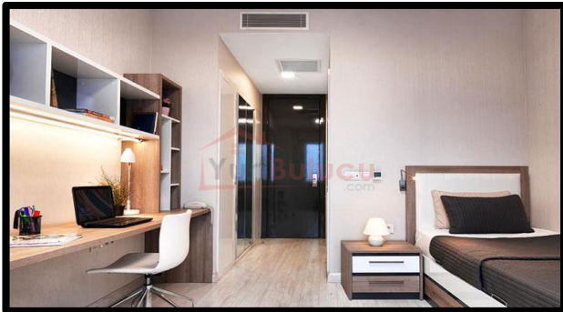
Fig. (4) 23