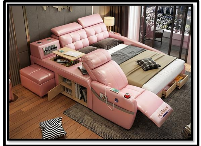
Figure (3) The dynamic of the dwelling and its relationship to flexible furniture 16

physical dynamism, by creating stability in the spaces of the rooms and reversing the change in the shape of furniture and its uses, so that furniture pieces can be designed with more than one function as an alternative to multiple traditional pieces of furniture. 15 (See Figure) (3)