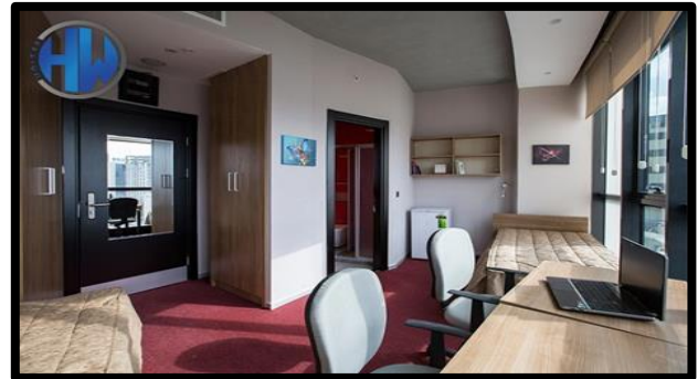
Fig. (6) 25