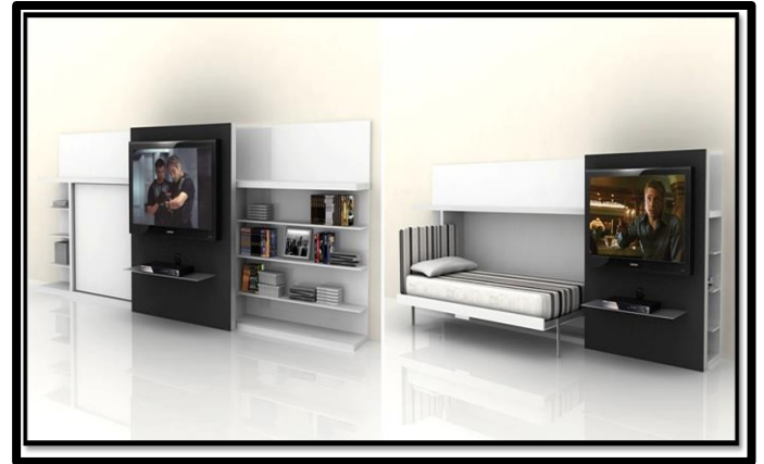
Figure (2) :Multiuse and Multifunctional Flexible Furniture 12

raised on the wall as part of it, as the multi-use built-in furniture shows the cleverness and ingenuity of the designer. , as the piece of furniture has two functions at least and sometimes more, and sometimes it is limited to speed and ease of storage, where flexible furniture is used in general for the whole family or for furniture prepared for guests only, in proportion to the available space. 11 (see Figure) (12)