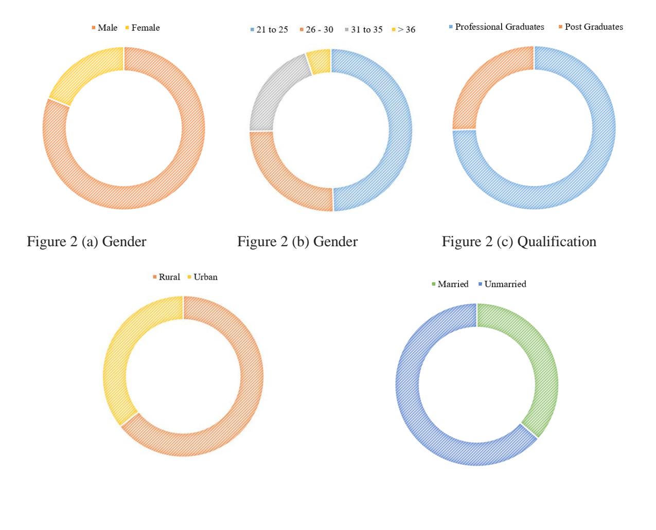
Figure 2 (d) Living Place