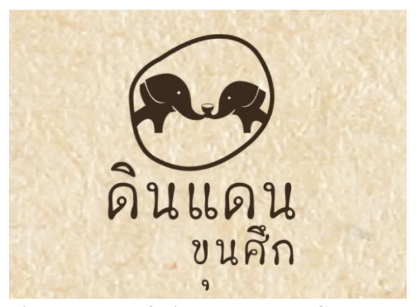
Figure 7 Logo of Dindan Khunsuk Clay Pottery

abundance in life. The logo was designed to be two confronting elephants whose trunks are getting together holding clay pottery. This logo represented the harmony of the people in the Dindan Khunsuk clay pottery group in Talad Mai Community.