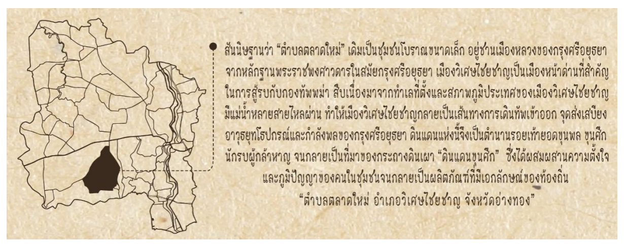
Figure 4 The history of the local area presented on the packaging