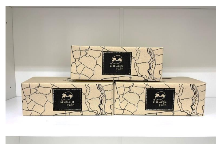
Figure 6 Packaging Display

The packaging was designed in a rectangular shape that was easy to put down everywhere and easy to showcase. It was also easy to overlay when being on delivery. The top of the packaging was adjustable to be a handle to make it portable and suited for being a souvenir.