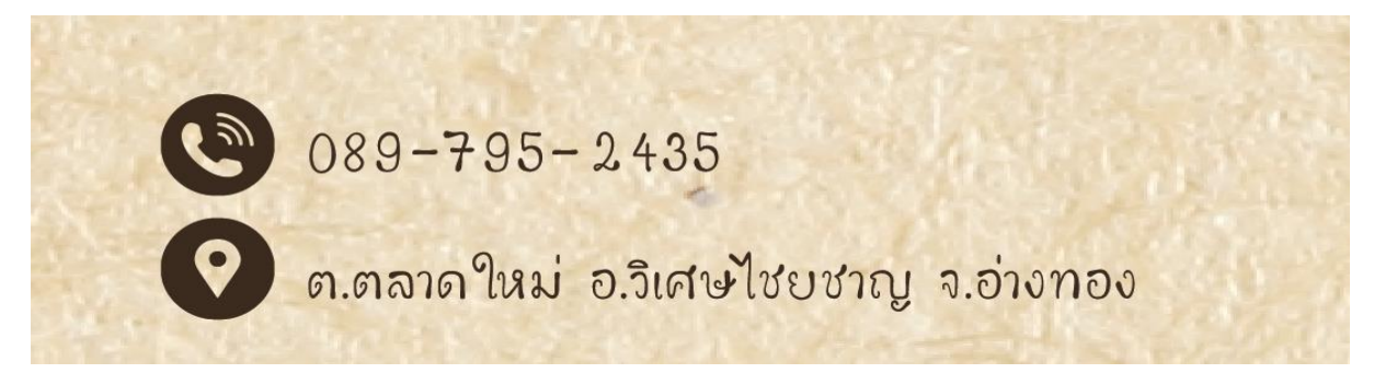
Figure 5 Contact Details