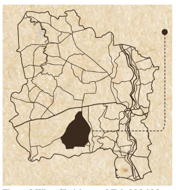
Figure 8 Wiset Chaichan and Talad Mai Map

produced in Talad Mai Community. This will enhance product recognition as well.