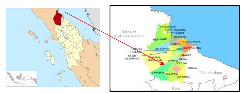
Figurat 2 Map of Langkat Regency