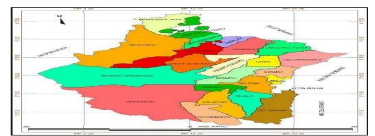
Figure 3 The Map of District Bahorok Bordering

Bukit Lawang the multifaceted process of identity-formation by shaping a small tourist village, located at the Bohorok River and 86 km north-west of Medan, Northern Sumatera, Indonesia. The small village is located nearby the jungle so you have great views and always see the rainforest. The name Bukit Lawang means "door to the hill" which matches perfect to its main meaning. Bukit Lawang is one of the most popular tourist destinations on Sumatra as it is the main access point to enter Gunung Leuser National Park from the east side-one of only two remaining natural habitats for the Sumatran orangutan. Further way Bukit Lawang is mostly known for the Bohorok Orangutan Sanctuary of the Sumatran orangutan, the largest one.