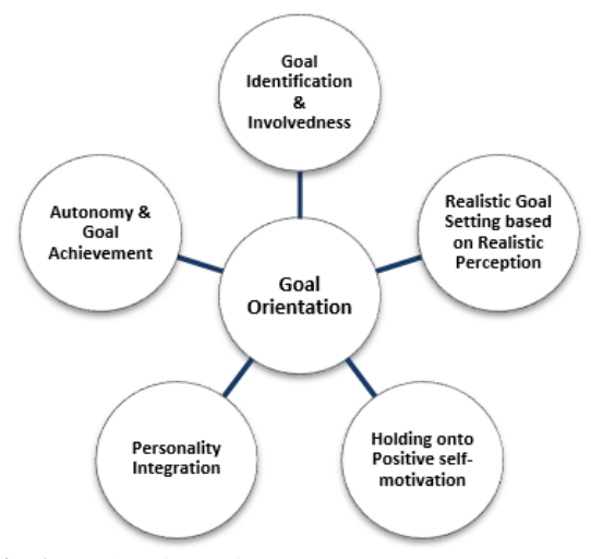
Fig.1 Goal Orientation Process

ability. Studies show that understanding goals from a cognitive perspective lead to self-efficacy, motivated learning ability, meta-cognitive learning strategies (Nicholls, 1984). Goal-orientation helps students become aware of the need for achievement and strive to work, progress towards the goals set and achieve their goals finding solutions needed to meet future challenges (Duda, 1992).