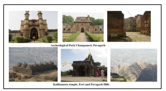
Plate 2: Glimpse of Chapaneri archeological sites and Pavagarh temple and hills