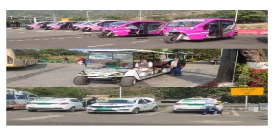
Plate 4: Electronic rickshaw and taxi: Ecotourism at Statue of Unity

Ekta food court, Terracotta utensils and Handmade soaps and Handwashes