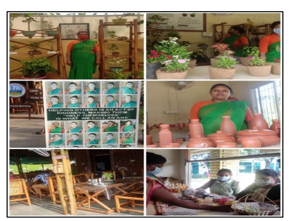
Plate 3: Self Help Group: Women working at 'Ekta nursery'; Creating Bonsai art, Organic pots,

In contrary it was found that tourism in Champaneri Pavagadh the destination sustainability is based on the historical, archeological as well as religious tourism hence cultural tourism was slightly more than other indicators of destination sustainability. The data extracted through this study showed that there were low growth of small businesses in the area and need more improvement of living standards of local's and job opportunities and benefits, tangible benefits (increased in revenue and reduction in cost) and benefits to local and host communities. Also there were less development of Infrastructure and low empowerment equality in terms of gender, ethnicity, age, and disability among local communities and less infrastructure for recreational activities. In this destination local and domestic as well as religious tourism was observed.