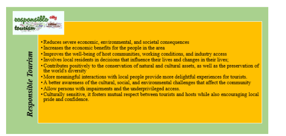
Fig 1. Characteristics of Responsible Tourism