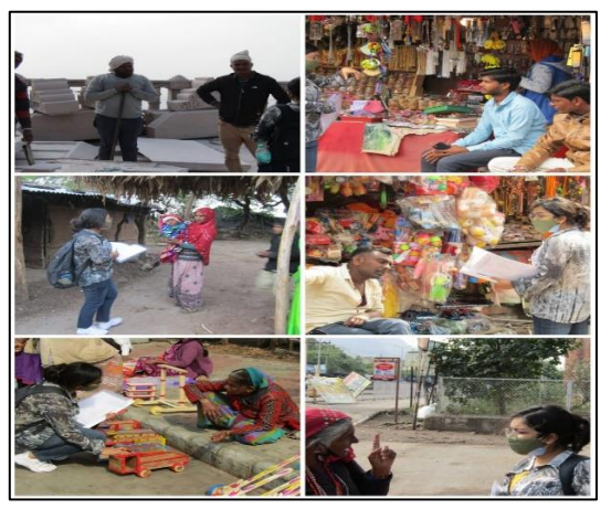
Plate 5: Conducts a Survey: Local Residents at Champaneri, Pavagarh.

Whereas, Champaner, Pavagadh tourism, emotional wellbeing indicated spare time, invasion of tourists, religious services, cultural preservation, cultural exchange and spiritual life. In contrary the respondents disagreed that safety well-being includes reduction of accident and crime rate, environmental cleanness, safety and security, quality of life in general, enjoying life events overall life satisfaction from responsible tourism.