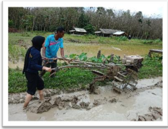
Figure 3: implemental process, organize the rice field on the actual learning base.

This visit to the area giving youth to have the opportunity to learn from the process of rice breeding, plowing, cultivating, harvesting and maintenance of rice plants including exchanging experiences through sages and senior farmers who are skilled and knowledgeable in the cultivation of rice for many years.