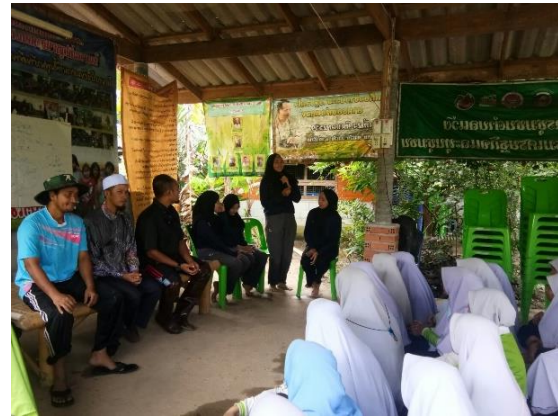
Figure 2: The process of training young people to transfer their farming knowledge to interested youth

This step is a process of training young people to transfer knowledge to interested youth. Therefore, they can be more conscious. Then they take the knowledge which gained from the first step and take lessons, analyze, synthesize and apply it to transfer knowledge. Also, they make a group to organize projects to disseminate knowledge and promote the younger generation to become more interested in farming.