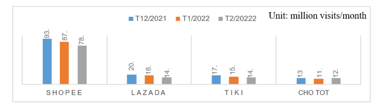
Figure 1. Total number of visits to 04 e-commerce exchanges in Vietnam