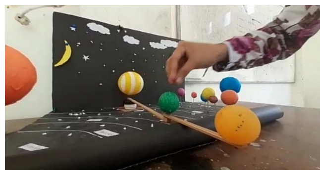
Picture: 2.2 Location of the Solar System

Students are able to manage and solve all learning problems. Based on the science process skills book so that students are able to draw conclusions from the results of the development of learning projects through implementation and creative creations.