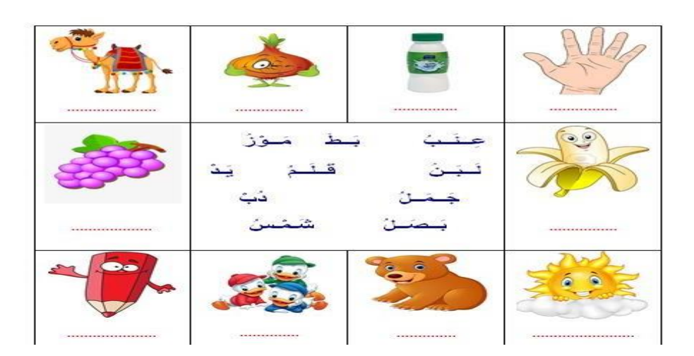
Fig.2. Sample of writing Test

Speaking Test. The aim is to assess child's ability to speak with the help of pictures. Word are presented and selected from the students' book to ensure that those words are familiar to children, was designed particularly for this study. A card with the