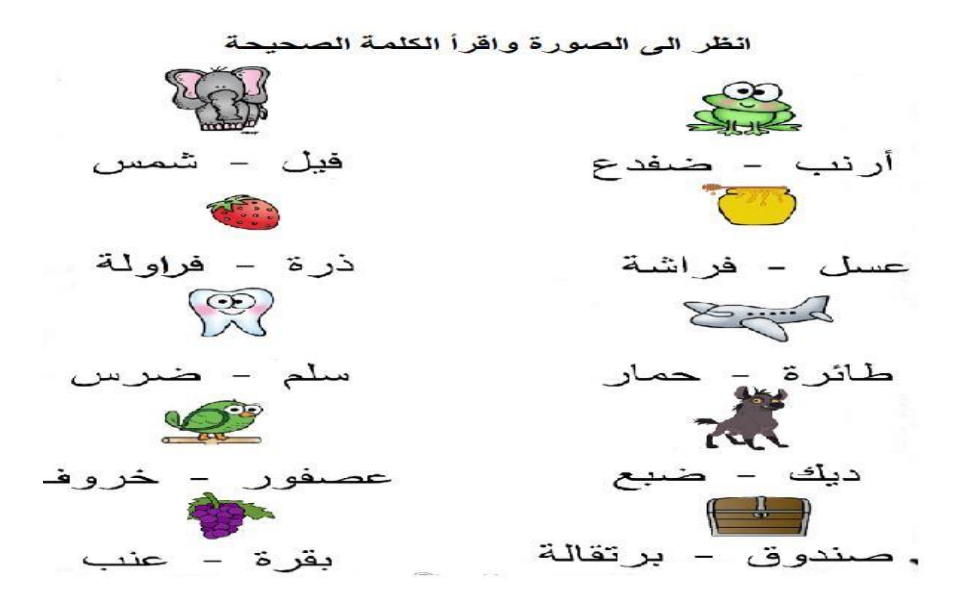
Fig.4. Sample of Reading Test

pictures was presented(see fig.4). The child is asked to the words that suits each picture. This is done individually. The corrected chosen picture is given one point. While the incorrect is given zero. Raw scores were used for analysis. For this task, good reliability (Split-half reliability coefficient = .88) was found.