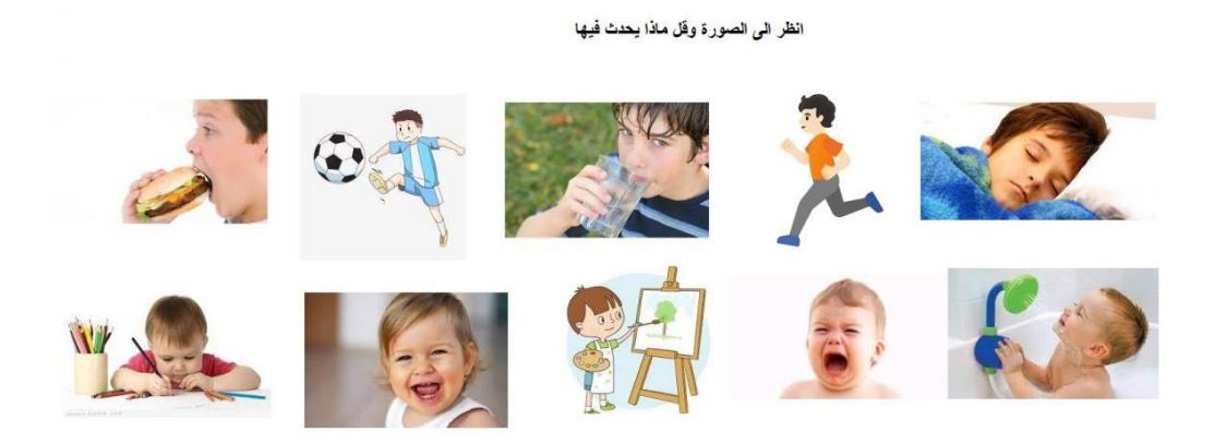
Fig.3. Sample of speaking Test

Reading Test. The aim is to assess child's ability to read with the help of pictures. Word are presented and selected from the students' book to ensure that those words are familiar to children, was designed particularly for this study. A card with the