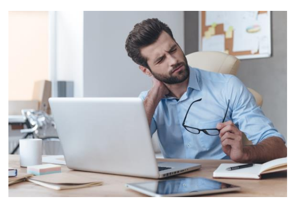
Figure 1: Example of a subjective pain severity scale

that a patient knows only how they feel and these scales can be effective in monitoring changes in pain intensity over time.