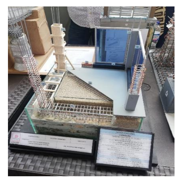
Figure 2. Construction process of a porticoed system.