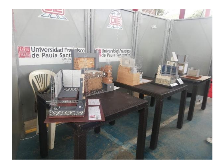
Figure 1. construction processes in models

the participation of students of the civil engineering program from all semesters (Figure 1). This fair contributes to the strengthening of competencies in students, such as: simulating civil engineering processes, applying knowledge, identifying, posing and solving problems, promoting innovation, development and creativity in future professionals.