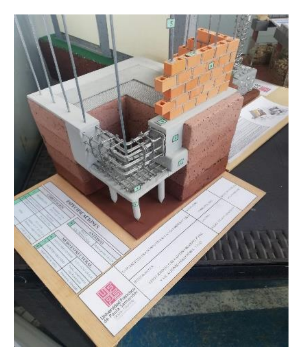
Figure 4. Construction system of walls and foundations.

With the presentation of housing projects of medium complexity, an instrument was developed to measure the pedagogical strategy where the generic and specific competencies of the students are