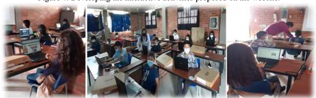
Figure 4. Developing the interactive activities proposed on the website.

motivating, given that adolescents currently like to exchange information through virtual spaces such as Whatsapp, social networks, and chat, among others. Therefore, it was significant that some introverted students were very active in their participation.