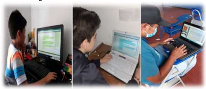
Figure 3. Student interaction in the virtual forum.