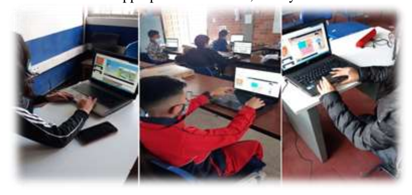
Figure 2: Interaction of students with the digital resources available for the appropriation of some social, family and school for the appropriation of social, family and school ethical values.